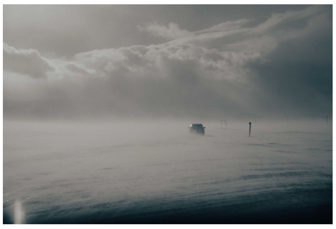
A Red Cross Red Crescent vehicle braves a severe snowstorm, barely visible amidst the swirling winds and snow, highlighting the challenging landscape conditions in Mongolia.